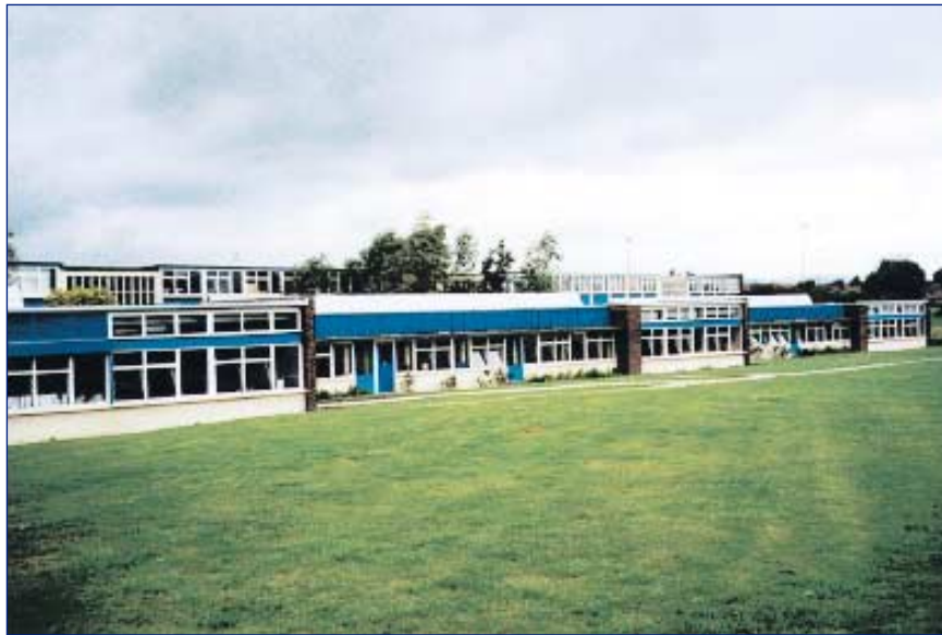
Figure 1: George Tomlinson School